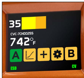
Tip temperature displayed on large color screen.