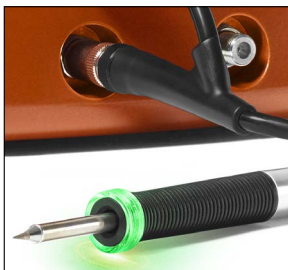
LED equipped hand piece signals to operator when a good solder joint is formed.