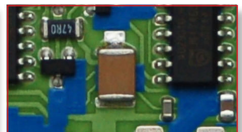
x12 zoom, 30x magnification